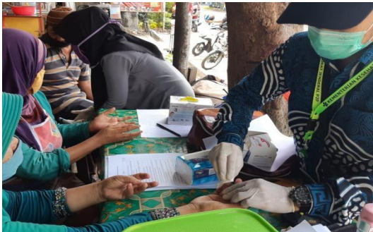
Fig 5. Non-Communicable Disease Screening (PTM) through blood glucose examination