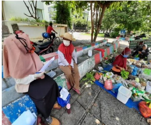
Fig 1. PHBS socialization activities to Ganesha Market traders by applying the Health Protocol.

This socialization activity was carried out individually and in turn with traders before the examination was carried out because this activity was carried out during the COVID-19 pandemic. The rule during the COVID-19 pandemic is not to create crowd-causing activities, and it is mandatory to implement health protocols.