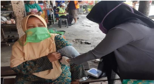
Fig 4. Screening of Non-Communicable Diseases (PTM) through blood pressure examination

Based on table 4 for blood glucose examination, the results were obtained, namely in the DM disease category, from a total of 25 traders examined, there were 8 people (32%) in the normal category, 16 people (64%) with the uncertain category of DM / prediabetes, and 1 people (4%) with the DM category, so it can be concluded that the majority of traders are included in the Pre DM category so that special attention is needed by the community and to the government to prevent DM disease, because if preventive measures are not taken by the community then this will potentially become a disease DM. What people who have the potential to do DM can do is to maintain a healthy lifestyle.