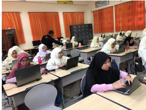
Fig 3. The collaboration of teacher and students in exploring the creativity

Collaborative writing experiences are known to enhance not only writing skills but also critical thinking and problem-solving abilities. Through Pixton, students can collaboratively plan, draft, and revise their comics, learning not only from their own writing process but also from the insights and perspectives of their peers (Ortiz Orellana & Mena Mayorga, 2021). This collaborative approach mirrors real-world scenarios where effective communication often involves teamwork and collective input, preparing students for the collaborative nature of the professional landscape.