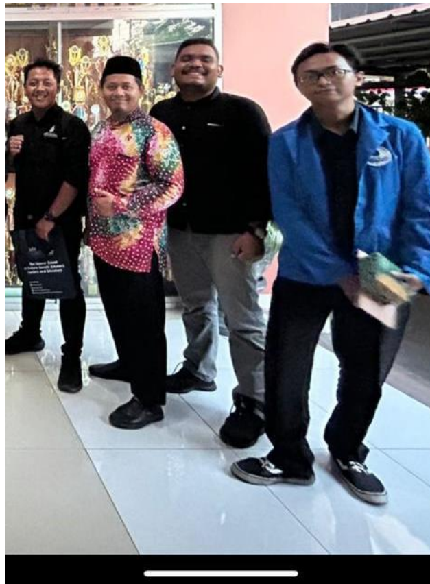
Fig 1. Observation to the classroom and teachers.

There were two steps in doing this project. The first step was observation to the teachers and stakeholder. It was found that students' engagement and creativity is low since they only write about what is instructed by the teachers. They also tend to limit their work as the fulfilment of the classroom task. After doing the observation, the next step was demonstration about e-comic based writing activities. It was about 90 minutes for the demonstration and explanation. Afterwards, it was continued by personal project for each students who attended the workshop.