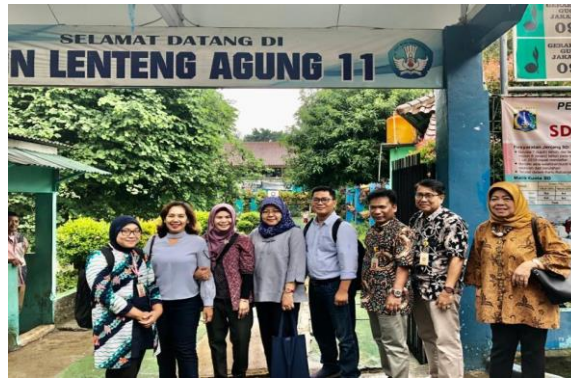
Fig 1. SDN Lenteng Agung 11 Jakarta Selatan

The time selection was determined in parallel with the joint service activities between IBI Kosgoro 1957 and Shinhan University. The determination of the location was determined because the school already had a business incubator and was in the location of the lower middle class community group. This is conducted purposively in order to have a snowball effect on the continuity of the community service programme.