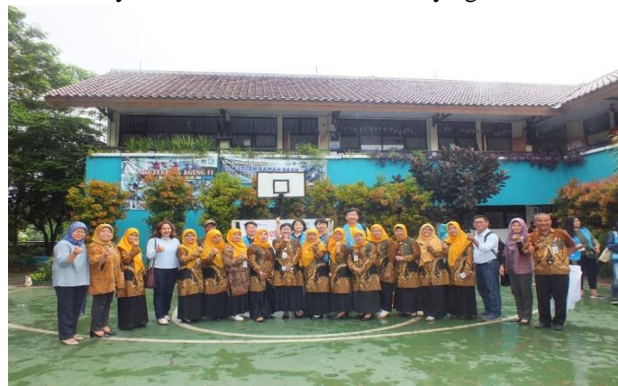
Fig 3. Photo session with all participants.

This programme was developed because based on data from the Ministry of Cooperatives and SMEs of the Republic of Indonesia, it was discovered that people who chose to become entrepreneurs were people with junior high school education levels and below, while only 6.14 college graduates wanted to become entrepreneurs. This condition became the main concern of IBI Kosgoro 1957. After being identified it turns out that the entrepreneurial mentality should be instilled at an early age.