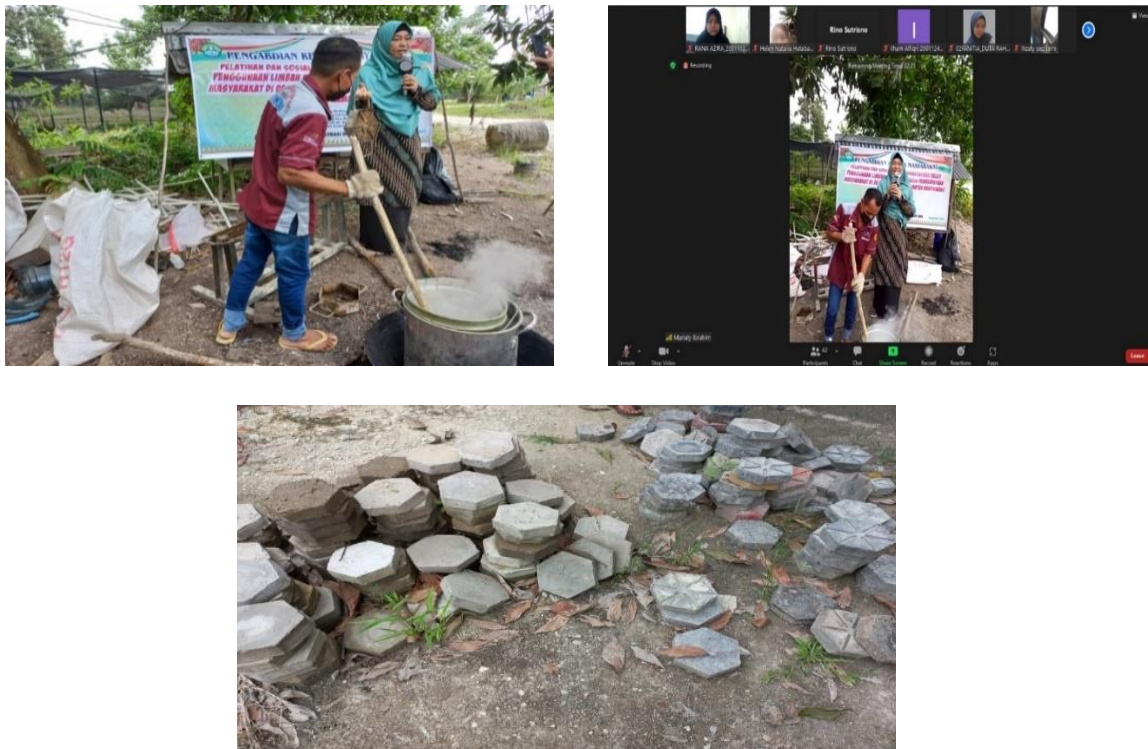
Fig 2. Waste Waste Process

The training was held as part of the delivery of the material and was carried out by resource persons at Okura. During the training, resource persons demonstrated how to handle plastic waste that had been heated in a frying pan with fire to melt it. After the trash is thawed, the waste is printed on a press machine assigned to resemble a paving block. The prints are then soaked in water for 5-10 minutes. Processed waste can be removed from the mold after cooling and hardening. The event also included a conversation component where participants from the Kuantan Village community were asked. Image No. 2 The team and resource persons explained how plastic waste materials are processed before printing into paver blocks.