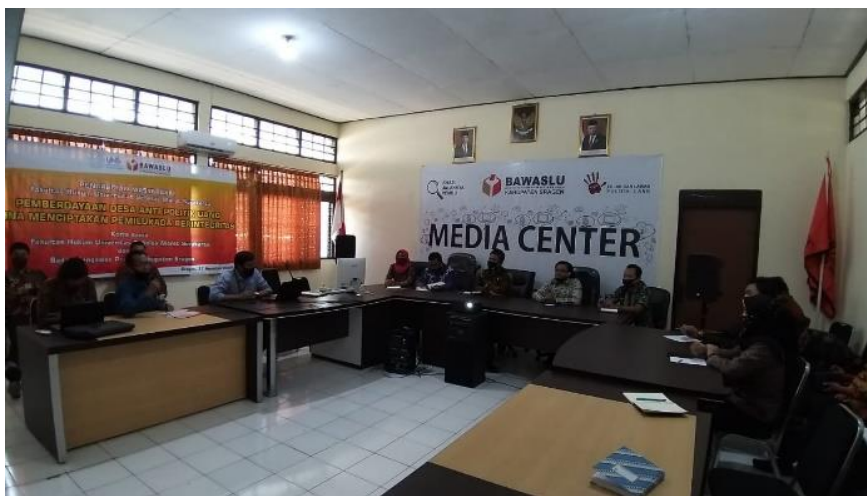
Fig 2. Socialization of Village Empowerment Against Money Politics at Bawaslu, Sragen Regency