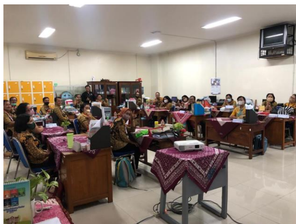
Fig 1. The activities of training

At this stage, the teacher gets several teaching theories that are in accordance with the use of technology in it. The first theory is interactive material. Interactive materials are materials designed to foster student interaction in the classroom. This allows students to further explore the metrics given by the teacher. Interactive materials can have a significant impact on students' motivation and understanding in the learning process.