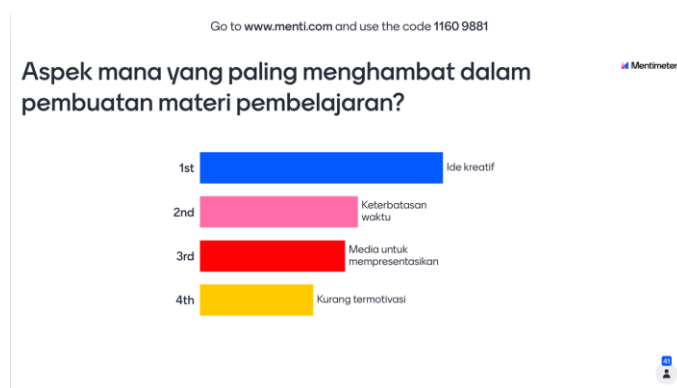
Fig 5. The use of mentimeter in gaining students' ideas

In the learning process, the mentimeter can be used as a medium of students' response system. Mentimeter is software that can be used by teachers to attract students' enthusiasm and improve students' communication skills. Interactive teaching can encourage students to be more active in the class. It triggers them to critically express their ideas and response since their work or ideas are posted in the virtual wall. In other words, teachers could use mentimeter to do ice breaking before the class started. By means of mentimeter, teacher also could lead students to elaborate their ideas about what have been studied and what are going to learn. It will give bigger possibility for students to be more prepared before the class and more active in finding the conclusion of the class.