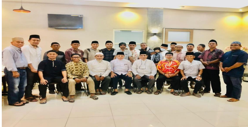
Fig 1. Photo with Faculty of Law Lecturers and Regional Leaders of Muhammadiyah North Maluku

as well as local Community Religious Leaders, and orphans the implementation of this activity was located within the Faculty of Law, Muhammadiyah University of North Maluku on Thursday 12 Ramadan 1443 H/14 April 2022 M. In this activity as the Dean of the Faculty of Law gave a speech in his speech he conveyed that he had strengthened the ties of friendship between the lecturers of the Muhammadiyah North Maluku region and students. And he also invites students not to create barriers between students and lecturers and always build ukhuwah Islamiyah towards true human beings.