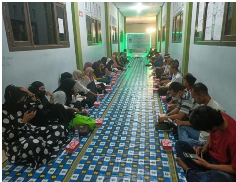
Fig 2. Iftar Together.