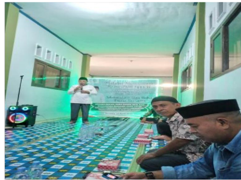
Fig 3. Message from the Dean of the Faculty of Law