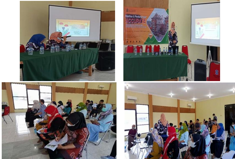
Fig 4. Presentation of the material and enthusiasm of the participants

The next event was the presentation by the presenters, which began with the types of financial statements, the importance of financial reports for business entities and an introduction to Accurate software and how to use the software. Accurate is a feature-rich accounting software specially designed for small and medium enterprises [9] The presentation of Accurate Software includes: how to create an initial database, the features in the Accurate software, introducing the existing modules, namely the general ledger module, bank cash module, inventory module, sales module, purchasing module, fixed asset module, list module. Offers convenience to carry out the process of making simple financial reports [10]