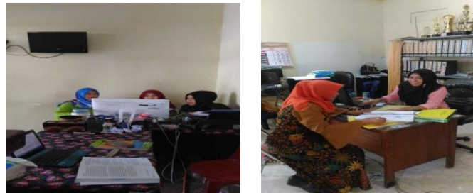
Fig 7. Mentoring

Assistance activities are carried out by direct practice of MSME actors in installing Accurate Software, creating an initial database, applying several modules that are often used in MSME transactions. The output of this activity: MSME actors can compile the initial balance of their MSME financial statements as an initial stage using accurate software. In addition, discussions were held on the obstacles faced when entering transactions into the accurate software.