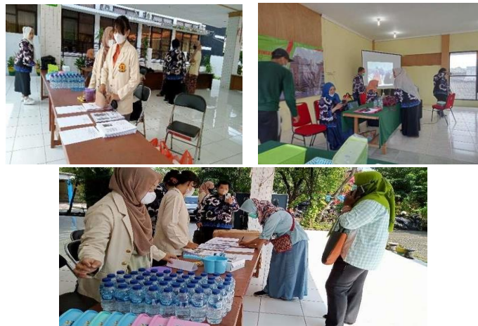
Fig 2. Preparatory stage

This service activity was initiated by the request of MSMEs in Sememi village to a team of lecturers at Wijaya Kusuma University Surabaya because of the obstacles they faced in compiling MSME financial reports. The request was followed up by a service team from the Faculty of Economics and Business, Wijaya Kusuma University Surabaya by providing training and assistance in the use of accurate software for MSMEs to improve financial report preparation literacy. This training activity was held on May 21-22, 2022, in Sememi Village. The participants who took part in this training were MSME actors in Sememi village. The following are the initial activities carried out before the training takes place: