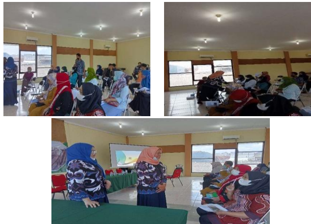
Fig 5. Ask a question

In the final activity, the presenters and implementers provided reinforcement on the material that was considered important and provided enrichment. Before ending, the presenters and training participants conducted a question and answer session to discuss things that were not yet understood.